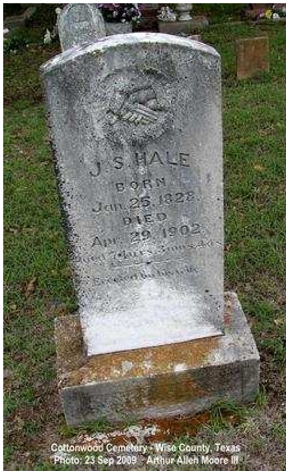
Cottonwood Cemetery - Wise County, Texas Photo: 23 Sep 2009 - Arthur Allen Moore III